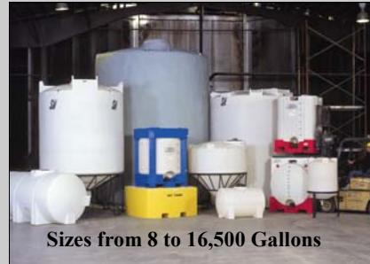
Sizes from 8 to 16,500 Gallons