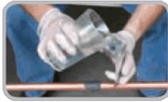
2. Immerse Wrap in Water