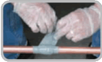
3. Wrap Pipe