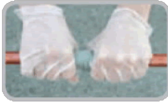
4. Tighten for Approx. 4 Min