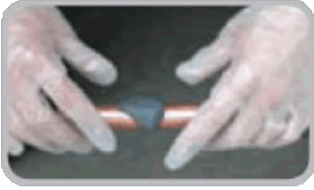
1. Apply Epoxy Putty