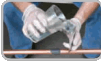
2. Immerse Wrap in Water