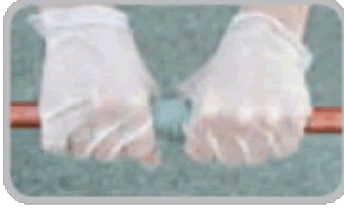
4. Tighten for Approx. 4 Min